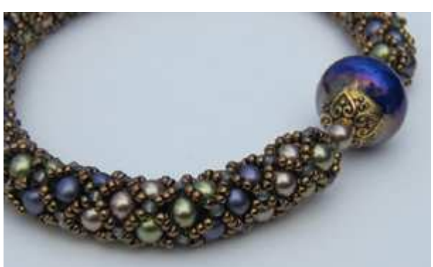
Note that there is string of silver beads missing from the picture of the middle color combination.