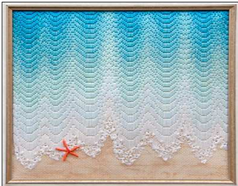
"Walking the Water's Edge"

This class is for the intermediate stitcher who wants to learn how to use floss to produce subtle shading, and to experiment with freeform eyelet stitching. We will include instructions on how to add some beads to the foam to give a dummy sparkle to the wave. As a finishing touch, you will learn the Button Knot Stitch to place a starfish on the shore.