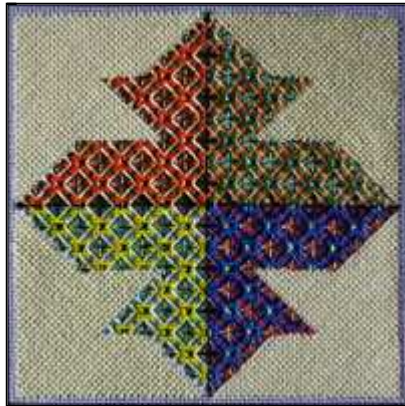
Color choice: Spring