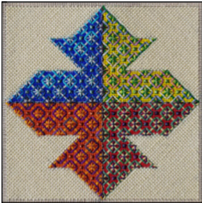
Color choice: Seasons

Your color choices are (you select one):