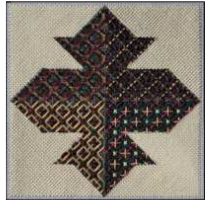
Color choice: Jewel

A coupon is provided for this meeting. Deadline for registration is April 1st.